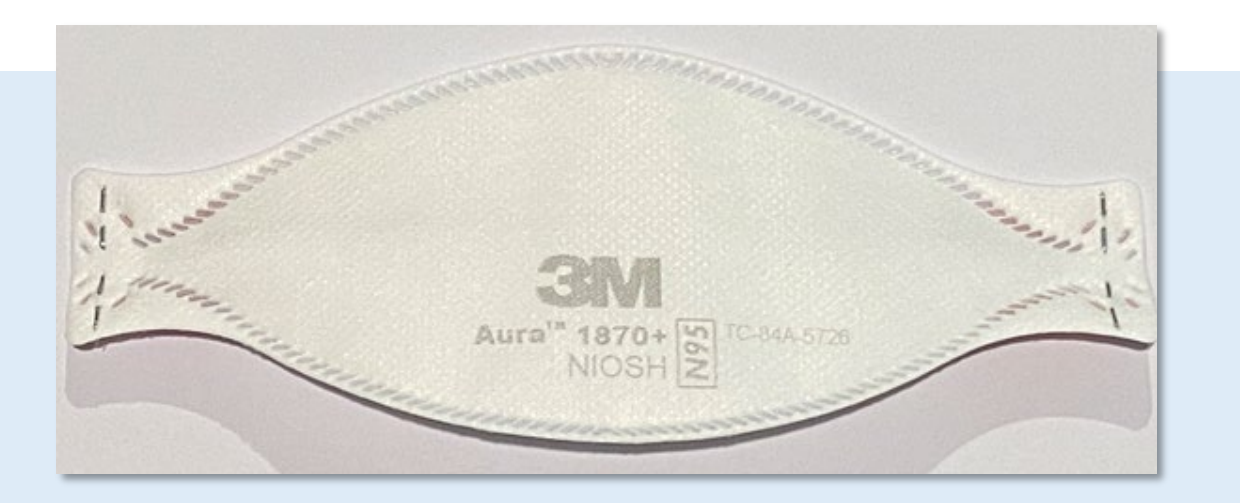
An example of product markings for an N95 respirator on the face piece

A guide to common indicators of non-compliance can be found here.