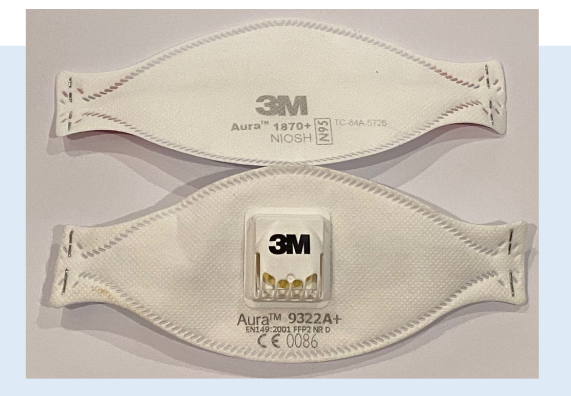
Examples of non-valved (top) and valved (bottom) respirators

It is important to note that respirators with exhalation valves enable unfiltered air to be released outside of the respirator. For this reason, if the respirator is being worn to protect others from droplets and particles exhaled by the wearer then respirators with exhalation valves are <u>not recommended for this application</u>. The selection of a suitable respirator should take this into account.