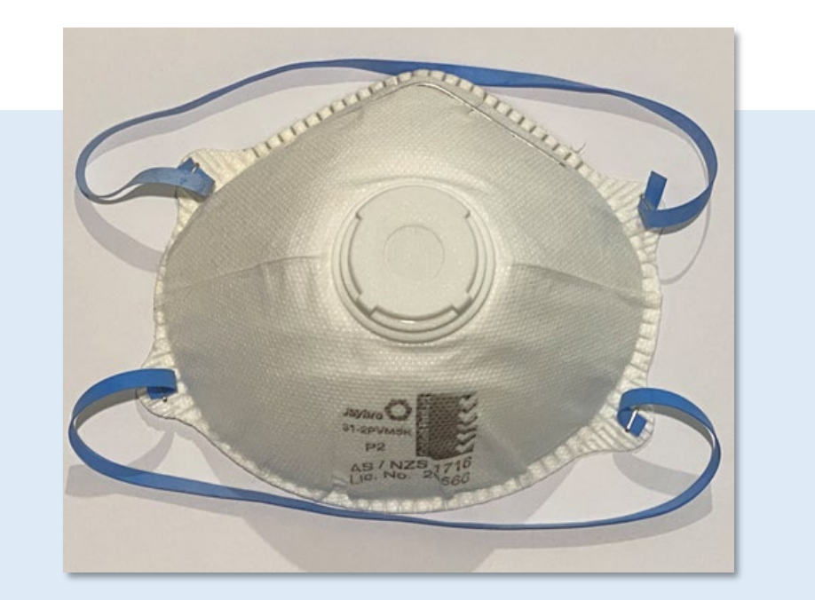
An example of product markings for a P2 respirator on the face piece

A Guide to Buying P2, or Equivalent, Respirators for Use in the Australian & New Zealand Work Environment