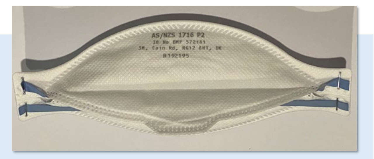
An example of product markings for a P2 respirator on the face piece

For products to be approved as a P2 respirator, they need to meet the requirements of AS/NZS 1716 Section 4. A reputable supplier or manufacturer should be able to supply you with a Certificate of Compliance or similar document stating the identified product is a P2 respirator compliant with AS/NZS1716:2012.