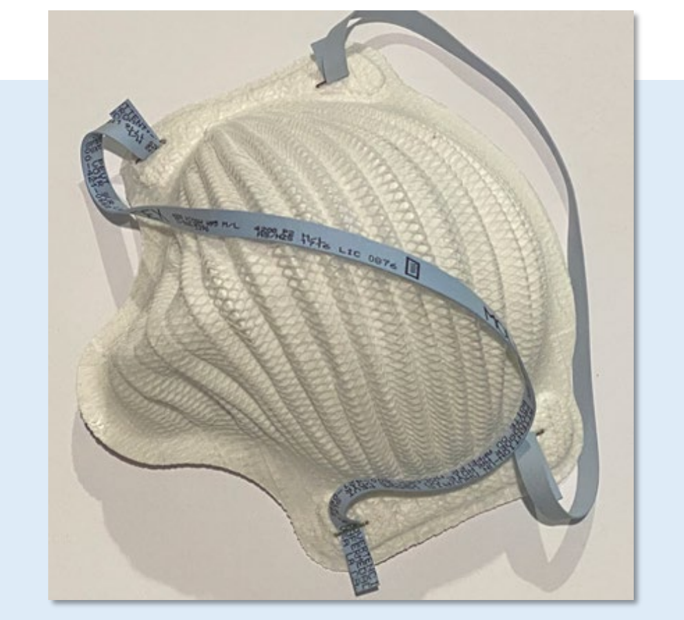
An example of product markings for a P2 respirator on the head straps

Markings may be displayed on different parts of the respirator. Some examples are shown below.